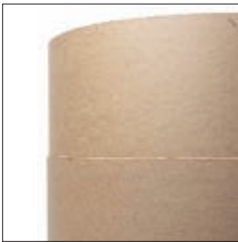
AF Flush Body

To aid product release, Bitupak incorporate a silicone lining for the packaging of solid setting products.